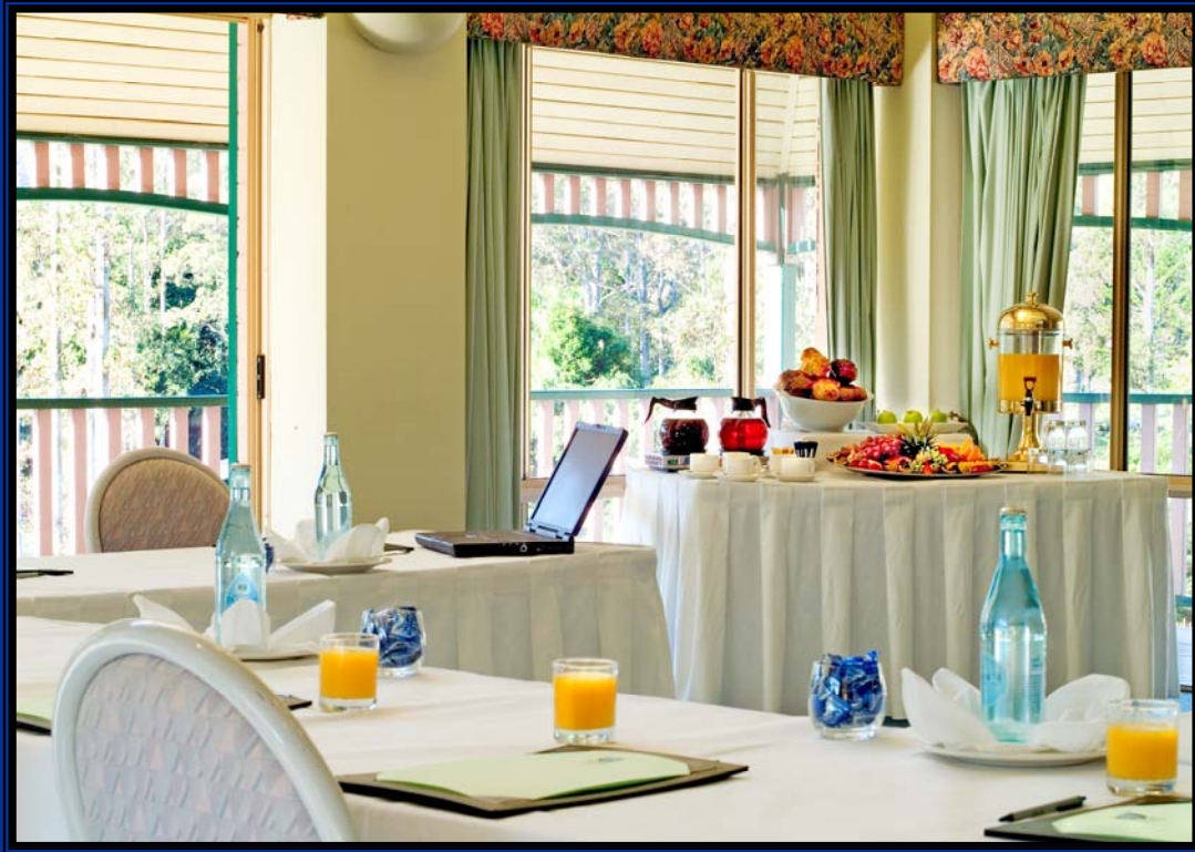
The Gallery, overlooking the beautiful surrounds

Bonville is the perfect venue for your next boardroom retreat or conference. A boutique style property with 30 accommodation rooms and two conference venues creates a sense of privacy for your personalised meeting.