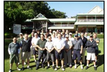
L to R: Welcome scoreboard overlooking 18th, carts before a shotgun start, group surrounding 18th green, group photo before tee off.